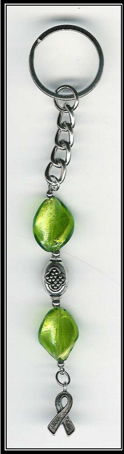
KC #3 $4.99