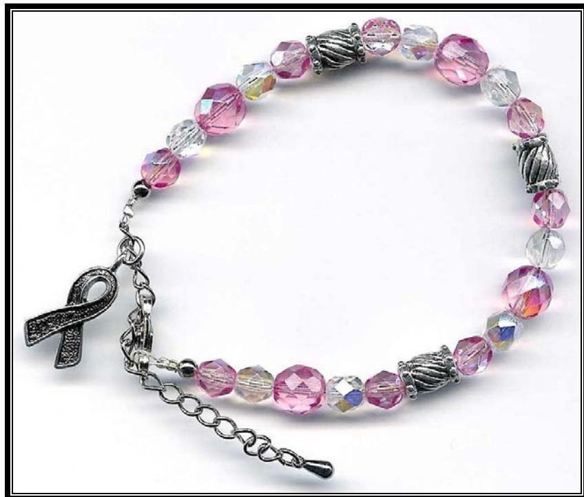
BR #6 Cost: $6.00