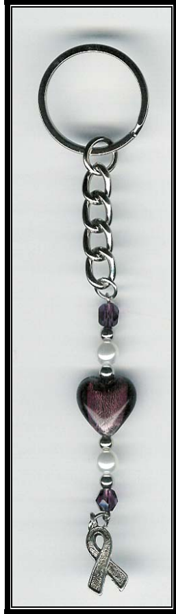
KC #2 $3.50