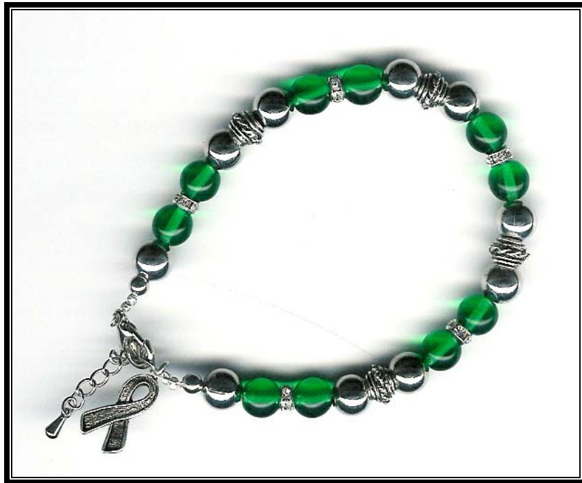
BR #5 Cedars Custom Made Bracelet Cost: $10.00