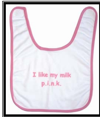
Baby Bibs Cost: $5.00