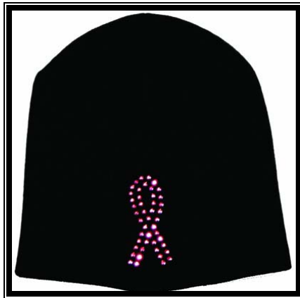
Breast Cancer Hat Cost: $6.50