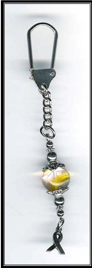
KC #1 $2.50