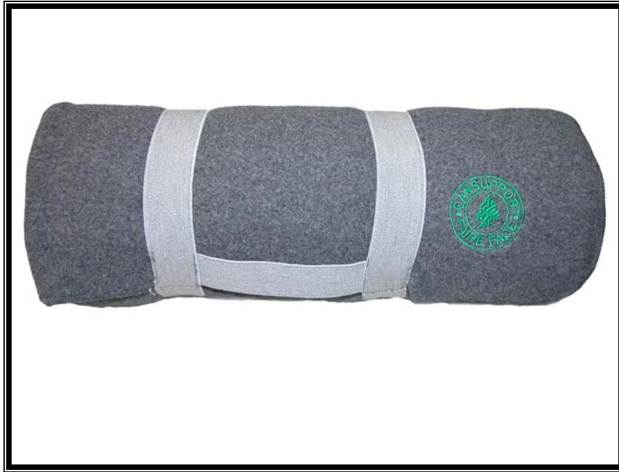
Cedars Buddy Blanket $20.00