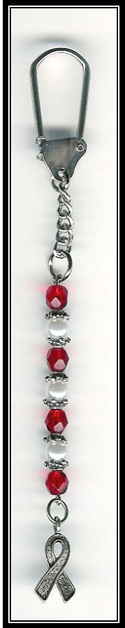
KC #4 $2.50

All key chains are made from various types of glass, metal beads and Glass pearls.